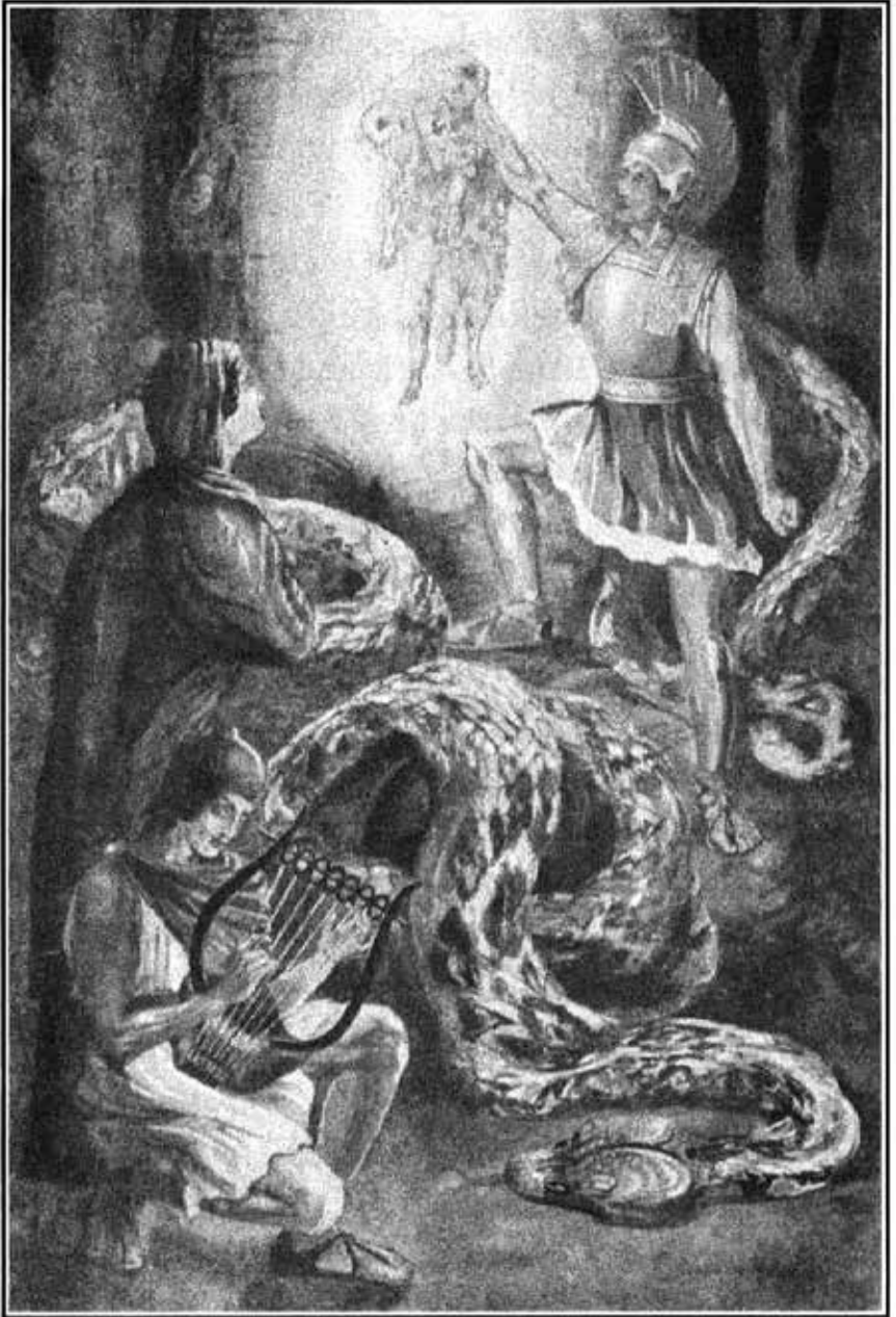
JASON, MEDEA, AND ORPHEUS WITH THE GOLDEN FLEECE