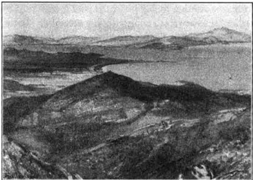
THE BATTLE-FIELD OF MARATHON FROM MOUNT PENTELIKON

said No! and the Greeks, great as they were, were not great enough to say Yes! in spite of Nature.