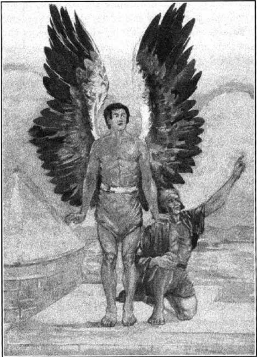
DAEDALUS AND ICARUS